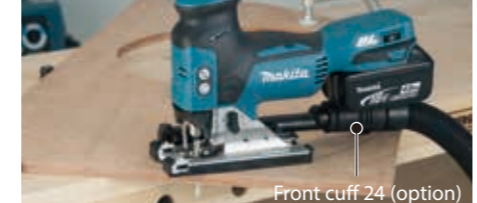
Dust nozzle can be attached over the sawdust exhaust port for connection to Makita vacuum cleaner.