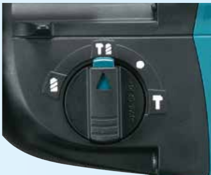
Photo : DHR263 Tool does not come with bit.

Dust cup (option) can be attached using adapter. (for DHR263 only)