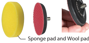
Sponge pad and Wool pad

Diameter: 75mm Easy to change Hook & Loop style Part No. 743125-4