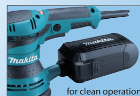
for clean operation

Cloth dust bag or Paper filter + Dust box